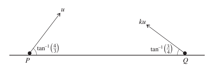
Two identical smooth balls, P and Q, are projected simultaneously towards each other from two points on horizontal ground. P is projected with speed u at an angle \tan^{-1}\left(\frac{4}{3}\right) to the horizontal and Q is projected with speed ku at an angle \tan^{-1}\left(\frac{3}{4}\right) to the horizontal (see diagram). The balls collide when they are moving horizontally. It may be assumed that there is no air resistance. Find the value of k.