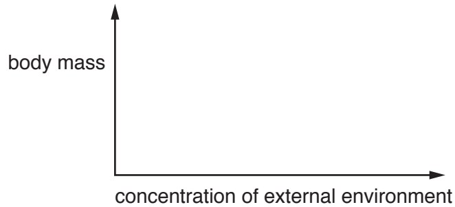
Fig. 3.2 [1]

(iii) On Fig. 3.2, sketch a line to show how the body mass of a mussel would change as the concentration of the external environment changes.