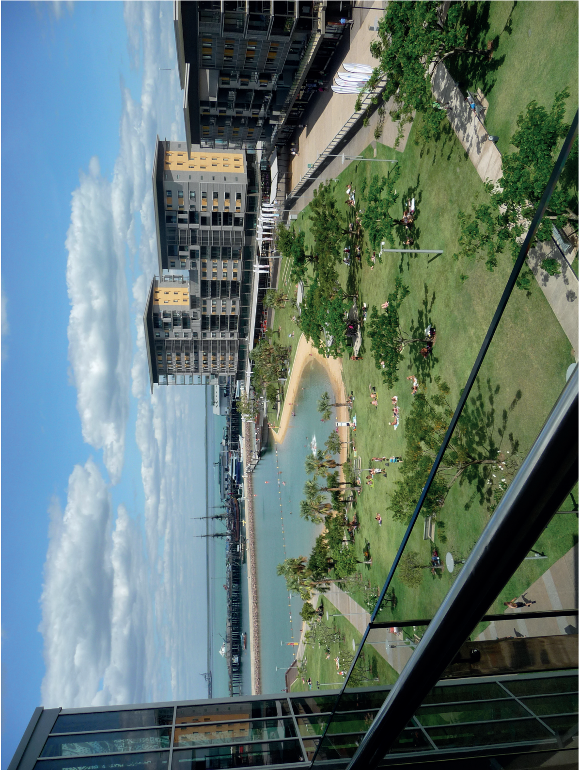
Photograph A for Question 4