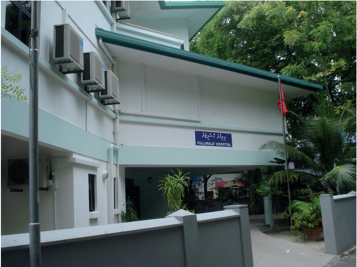
Fig. 2.2 for Question 2