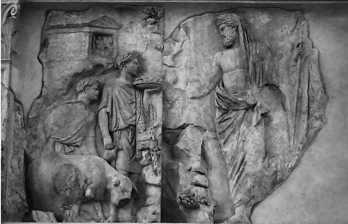
A panel of relief sculpture from the Ara Pacis Augustae .

1 Study the image below, and answer the questions which follow: