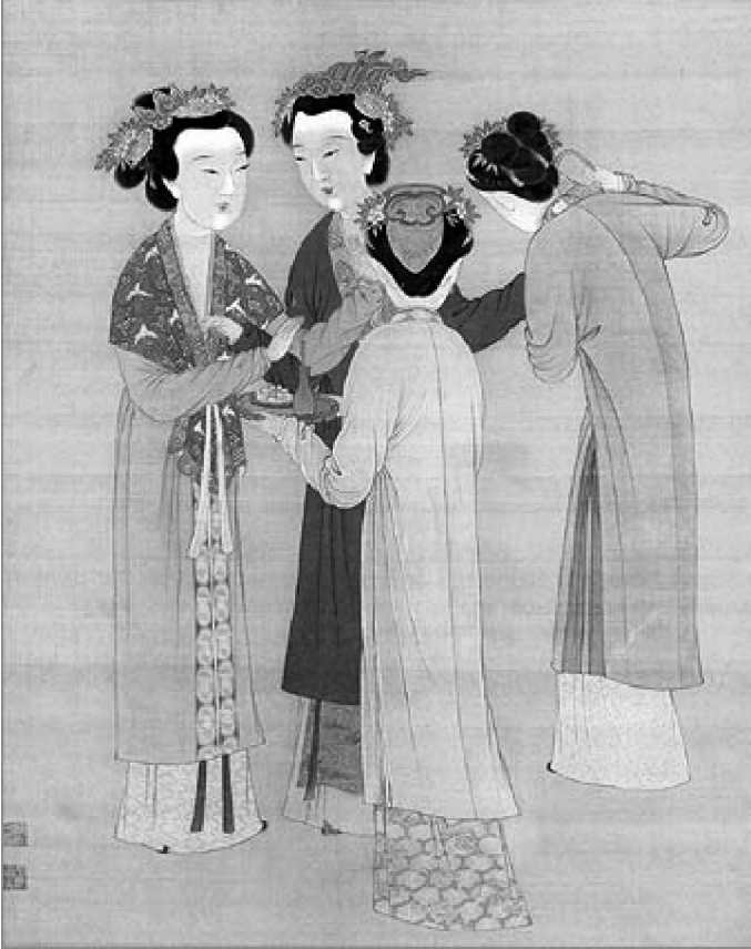
'Four Beauties', a Ming Dynasty painting

Extract adapted from an article on an English-language website sponsored by the Chinese Ministry of Culture