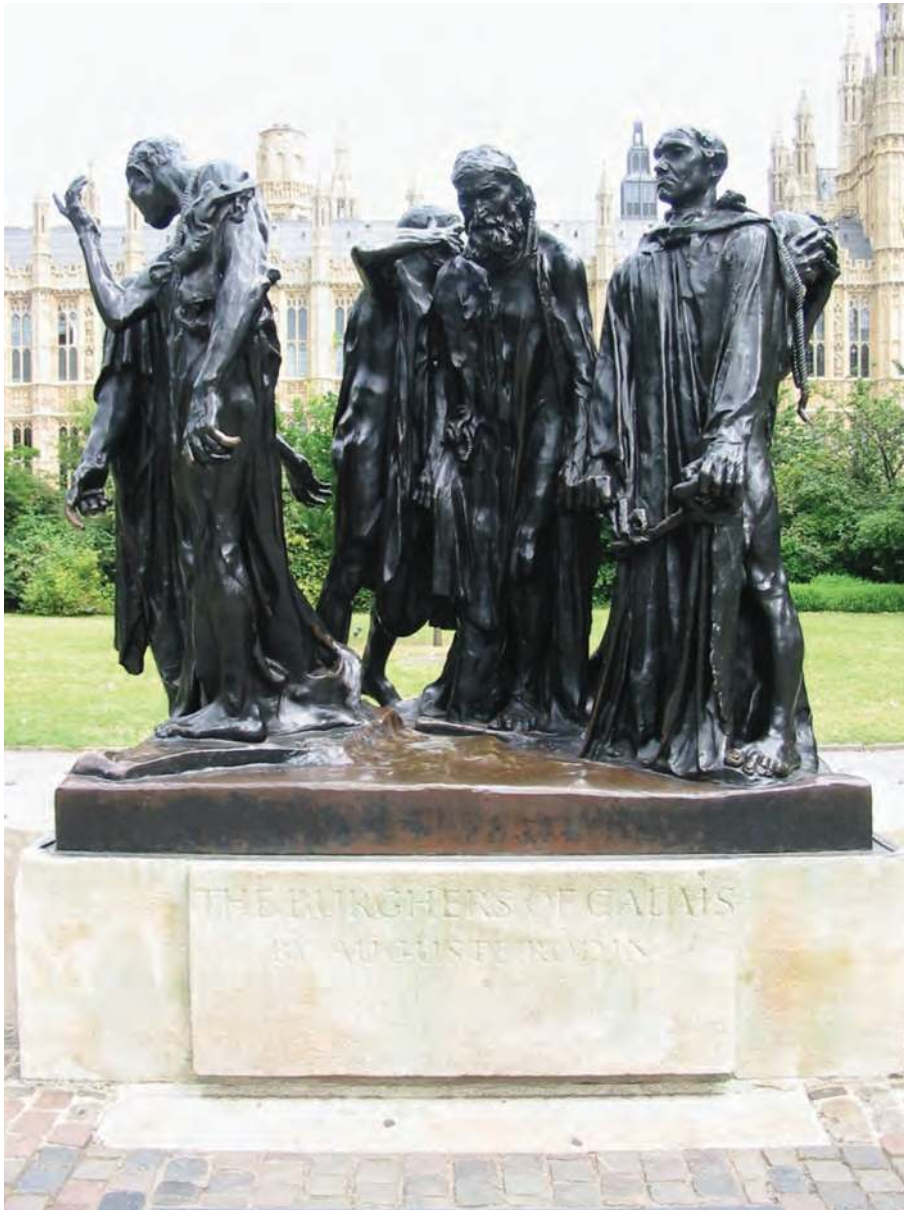
Auguste Rodin, The Burgers of Calais , 1884–6 (bronze)

(217 cm × 255 cm × 177 cm) (Victoria Tower Gardens, London)