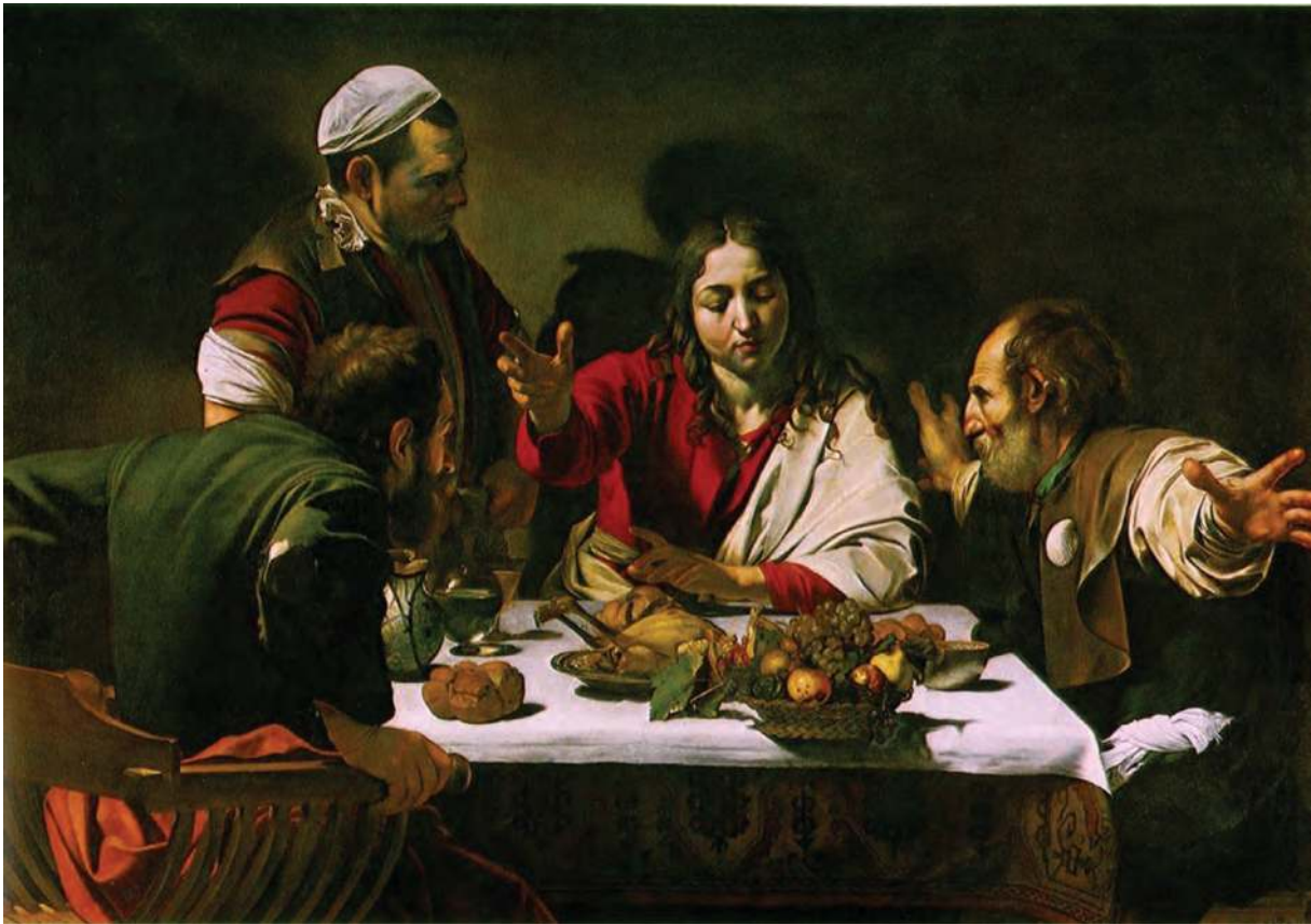
Caravaggio, The Supper at Emmaus , c.1601

(oil and egg tempera on canvas) (141 cm × 196.2 cm) (National Gallery, London)