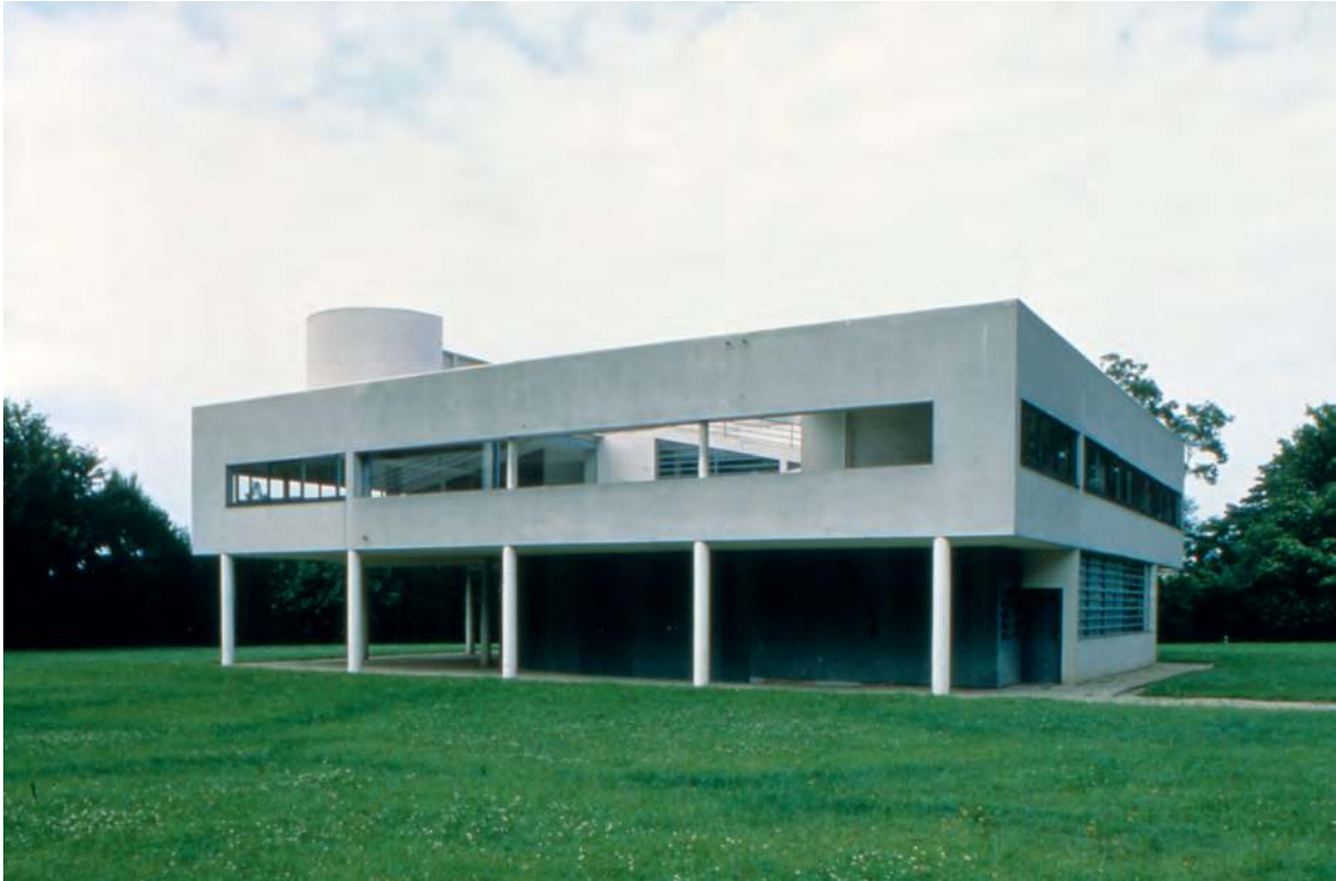
Le Corbusier, Villa Savoye , Poissy-sur-Seine 1929