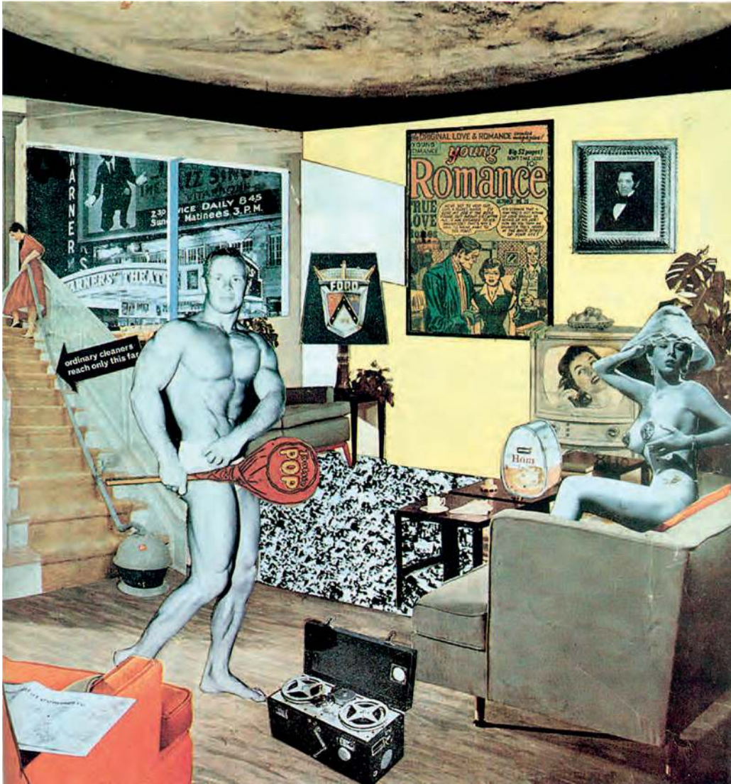
Richard Hamilton, Just what is it that makes today's homes so different, so appealing? 1956 (Collage) (26 × 24.8 cm) (Kunsthalle, Tübingen)