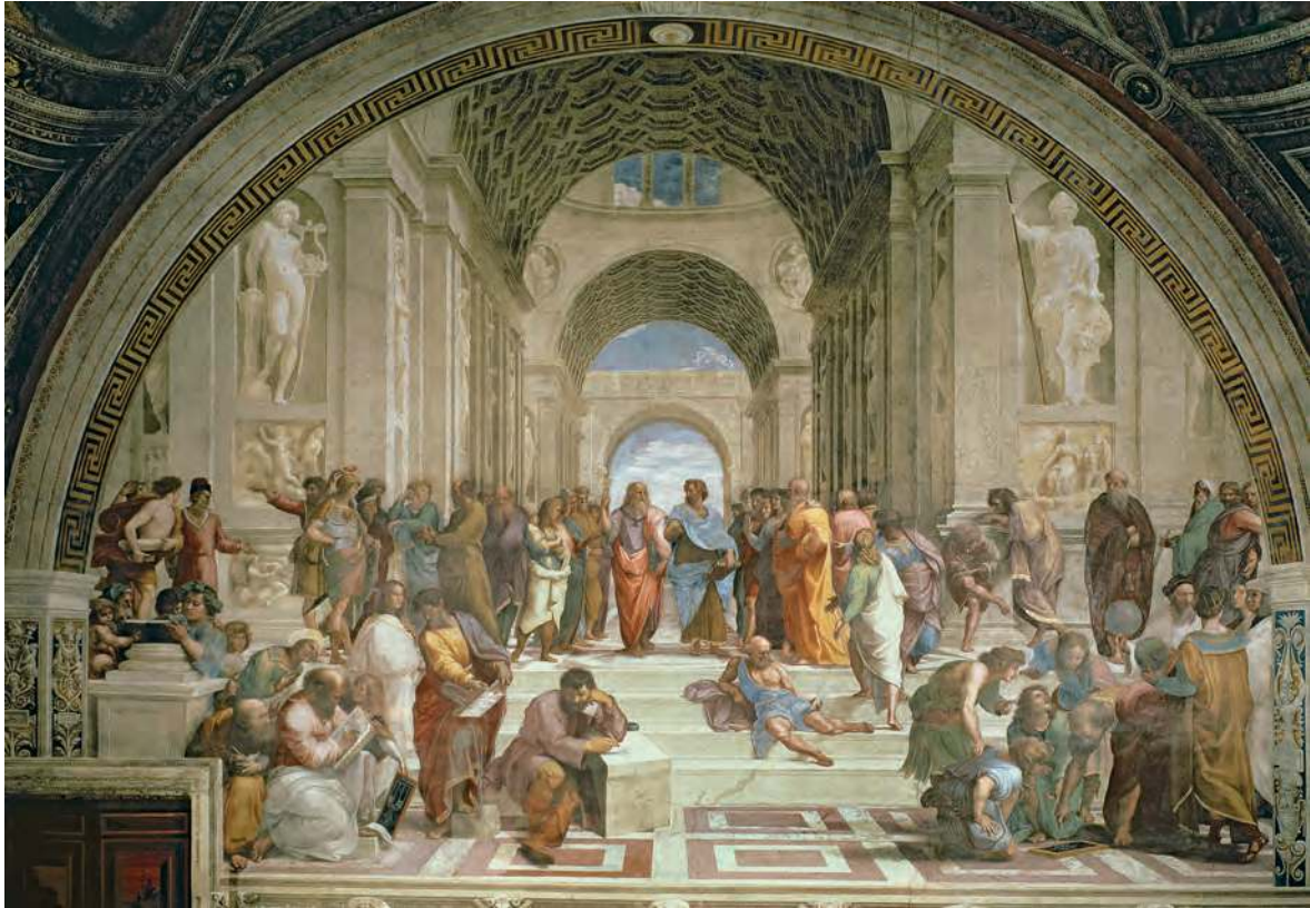
Raphael, The School of Athens , 1509–11 (fresco) (500 × 770 cm) (Stanza della Segnatura, Vatican, Rome)