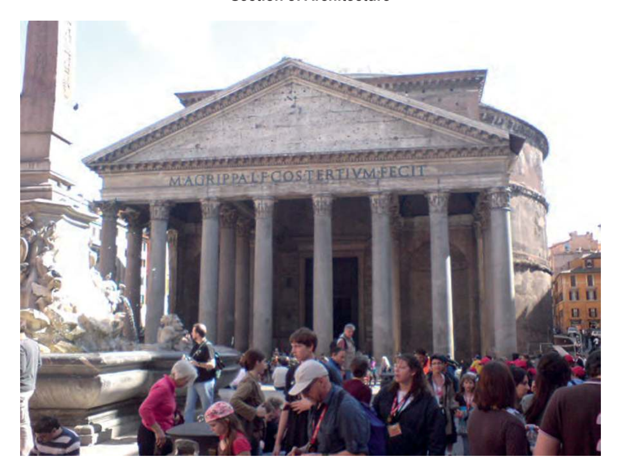
The Pantheon, c.130 AD, Rome

3 (a) Discuss the structure and materials of this building. [10](b) What was the purpose and symbolism of this building? [10]