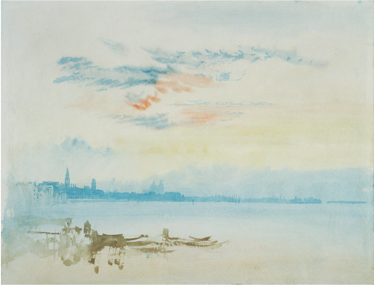
Joseph Mallord William Turner, Venice: Looking East towards San Pietro di Castello – Early Morning , 1819, (watercolour on paper), (223 mm × 287 mm), (Tate)