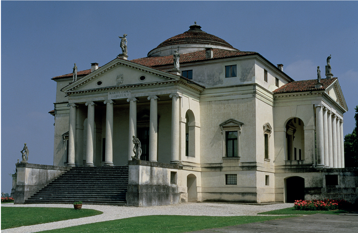
Andrea Palladio, Villa Rotonda , 1592, Vicenza, Italy