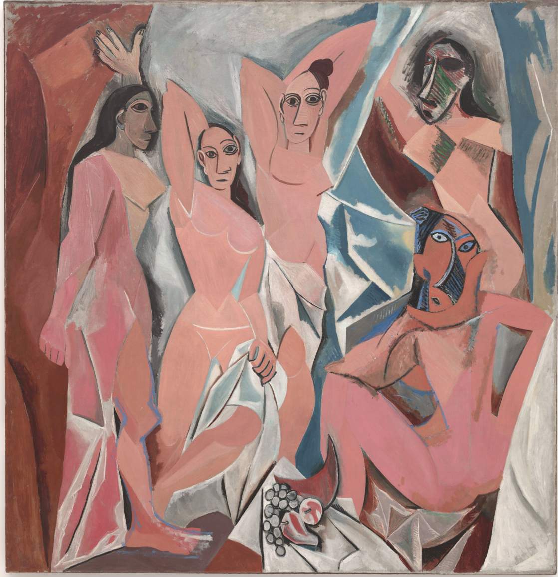
Pablo Picasso, Les Femmes d'Alger (O.K. Version) , 1911-12, (oil on canvas), (244 cm × 234 cm), (Museum of Modern Art, New York)